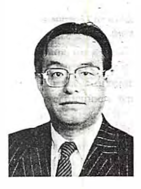
Born in 1936. Received his doctorate in international relations from the University of Tokyo. Is now a professor and director of the Institute of Foreign Affairs at the Tokyo University of Foreign Studies.

Since Japan is East Asia's preeminent economic power, some people want it to take the initiative in fashioning a new regional order. Such an attempt would, however. be premature. For one thing, work--ing relationships cannot easily be maintained among countries differing vastly in everything from political systems to stages of growth. For another, the history of China's imperial domination and Japan's military aggression has engendered resistance to leadership by any single country. Before a new order can be built, a foundation must be laid.