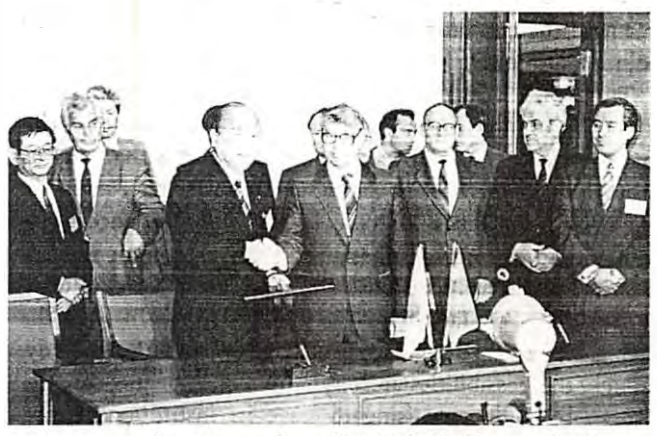
Local networking: In one phase of his bridge-building work, Oita Prefecture's Governor Hiramatsu is shaking hands with Russians.

militarization is not in the cards. But the ghost of the Greater East Asia Co-Prosperity Sphere still haunts those who were victimized by Japan's military aggression, and it may take another half century for Japan to regain other countries' trust. There is also great resistance to giving Tokyo political clout in the region in addition to its overwhelming economic might.